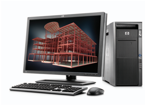
HP Z800 Workstation