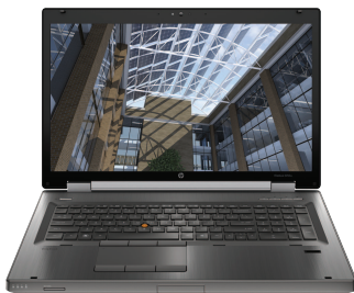
HP EliteBook 8760w