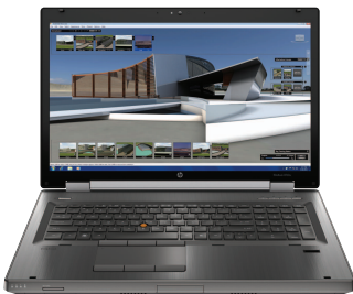
HP EliteBook 8760w

The HP EliteBook 8760w featuring Microsoft® Windows® 7 offers the power and performance of 2nd Generation Intel® Core™ processors to run Autodesk Building Design Suite in a mobile form factor with an expansive 17-inch diagonal widescreen display. The HP EliteBook 8760w features easy upgradability, an intuitive touchpad, enhanced designed in durability, gunmetal casing, and military-grade testing 8 to help ensure premium performance inside and out in demanding environments.