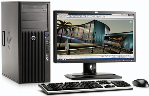
HP Z210 CMT Workstation

The HP Z210 CMT Workstation is certified for Autodesk® applications,* including those in the Autodesk Design Suite. The HP Z210 leverages the latest Intel® Xeon® processors and is one of the first workstations to provide Intel Xeon E3-12X5 processors 4,5 with Intel® Turbo Boost® Technology 2.0 3 for that extra speed to help Autodesk Design Suite users improve their productivity and efficiency. HP Performance Advisor comes at no cost on the HP Z210 and lets users easily configure, customize, and optimize the Workstation for each software program to help streamline decision making. The configuration reports can help Autodesk and HP support staff provide much quicker service and support if problems arise.