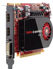
AMD FirePro V4800

AMD FirePro professional graphics cards deliver innovation and reliability for a wide range of professional operating environments. The unified driver, which supports all AMD FirePro professional graphics, helps reduce the total cost of ownership by simplifying installation, deployment, and maintenance. The AMD FirePro V4800 supports AMD Eyefinity Technology 1 and helps improve productivity. AMD FirePro M5950 Mobility Professional Graphics feature AMD Catalyst professional graphics drivers, which enable outstanding performance for many major CAD applications.